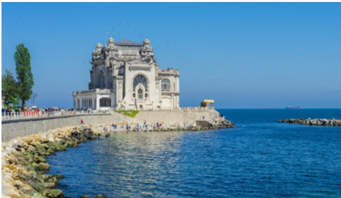
Constanta Casino: An emblematic place for the city of Constantza

The third largest city in Romania, Constanta is an important cultural and economic centre, worth exploring for its archaeological treasures and the Old Town's architecture. Its historical monuments, ancient ruins, grand Casino, museums and shops, and proximity to beach resorts make it the focal point of Black Sea coast tourism. Open-air restaurants, nightclubs and cabarets offer a wide variety of entertainment. Read more here: